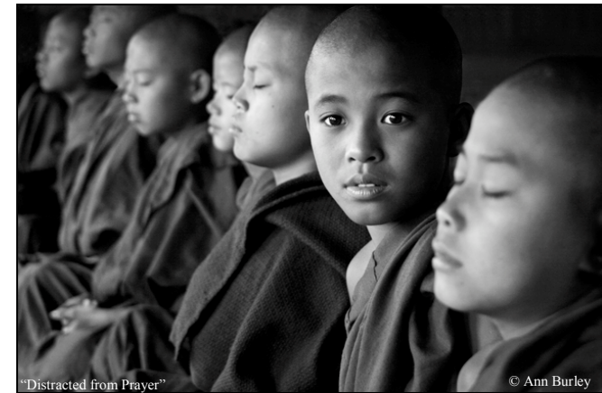
"Distracted from Prayer"