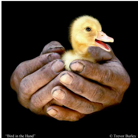
"Bird in the Hand"

P D A T = Last date for handing in Prints, Digital or AV entries for the next comp. T = Theme.